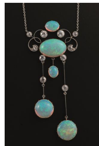
Edwardian platinum mounted Australian opal and old mine cut diamond stone set ladies' pendant necklace, circa 1905, £12,500 from Shapiro & Co

Fine furniture dealer Mark Buckley Antiques is bringing a late Victorian mahogany inlaid kidney shaped desk by Edwards & Roberts, £6,950 and amongst the oak and country furniture on Melody Antiques stand is an exhibition quality walnut stool made by cabinet makers Blain & Co, Liverpool, dated 1855 and with the workman's signature on the frame, £1,850.