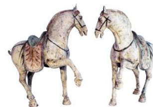
Matching pair of T'ang horses, Chinese, terracotta, 7th-8th century, over 53 cm high, POA from Odyssey Antiquities

P.O. Box 119 Cranbrook Kent TN18 5WB Telephone 01797 252030 E-mail info@adfl.co.uk Web www.adfl.co.uk Reg. no. 04293279 (England & Wales)