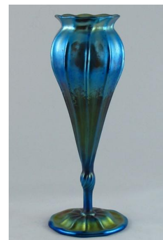
Tiffany iridescent Favrilite Floriform vase, signed, c.1910, £2,250 from Solo Antiques

Opening times: Friday 11 am – 6pm, Saturday 10.30am – 6pm, Sunday 10.30am – 5pm