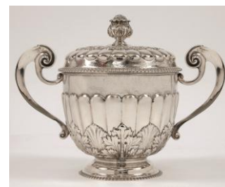
Silver cup and cover, London, 1906, £4,900 from Stephen Kalms Antiques