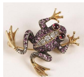
18ct gold leaping frog brooch/pendant set with pink sapphires, diamonds and garnet eyes, POA from Plaza