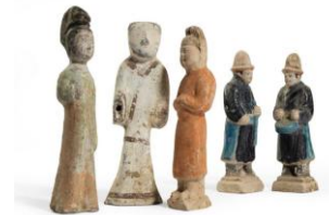
A selection of Chinese figures, 206BC - 1644 AD, £225 to £395 from Odyssey