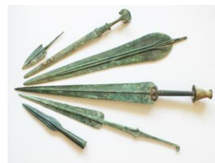
A selection of ancient British, Greek and Middle Eastern blades and arrowheads, dating from 2nd millennium BC, copper alloy (bronze), £55 to £650 from Odyssey

The Antiques Dealers Fair Limited has an ongoing relationship with the Queen Elizabeth Scholarship Trust (QUEST) , the charitable arm of the Royal Warrant Holders