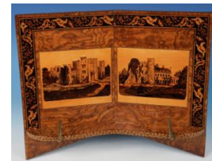
Tunbridge Ware bookstand and views of Tonbridge & Hever castles, c.1870, £945 from Amherst Antiques