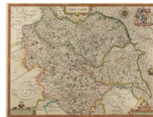
Map of the West Riding of Yorkshire by Jan Jansson, 1646, £595 from J Dickinson Maps & Prints