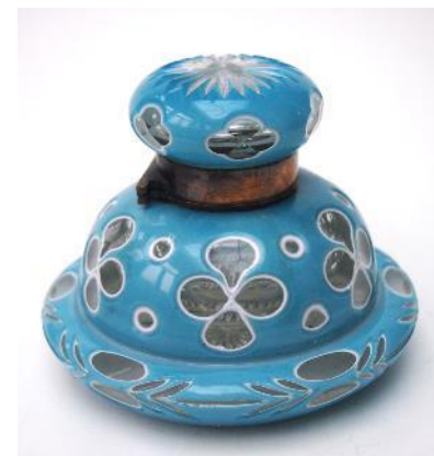
Bohemian double cased lidded inkwell with original insert, circa 1850, £750 from M&D Moir