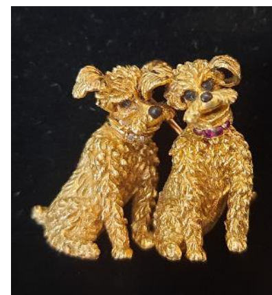
18 carat gold two terriers brooch, each wearing a ruby and diamond collar respectively, £850 from Markov