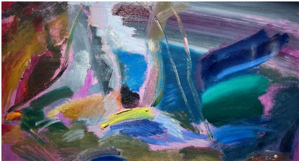
'Wildflower Wood' by Ivon Hitchens, oil on canvas, 40.5 x 74cm, 1975, £160,000 from Gladwell & Patterson

The Petworth Park Antiques & Fine Art Fair returns for three days in May to the grounds of the National Trust's Petworth House, Petworth, West Sussex from Friday 17 to Sunday 19 May 2024 . Unusually, this event has taken place successfully every year since its inception, despite having to move dates on more than one occasion, last year as a result of King Charles III's coronation. Even in 2020 and 2021, when the fair had to move months to take place safely during the pandemic, this fair has always been extremely well attended by collectors, interior designers, south of England residents and others from around the UK and abroad. Brilliantly supported by the local market town, which looks forward to this annual event with much anticipation, the businesses in Petworth put on a great show for the influx of visitors and this year will be no exception.