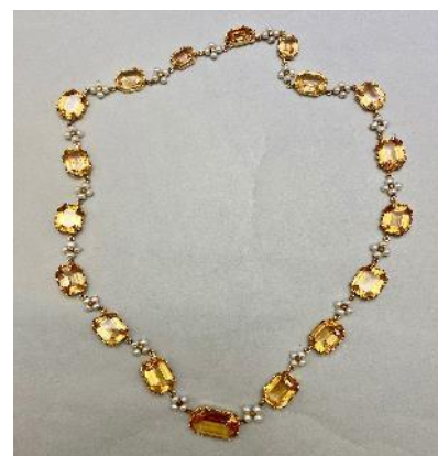
18ct gold Imperial topaz and natural pearl necklace, circa 1870, £12,500 from Shapiro & Co.