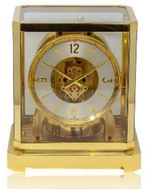
Jaeger LeCoultre Atmos clock, silvered dial, circa 1945, £2,500 from Jacksons Antique