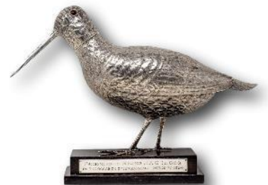
Dutch military silver snipe sugar sifter £3,500 from Jacksons Antique