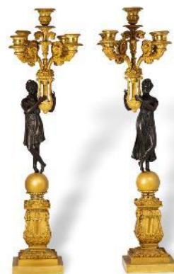
Pair of French empire candelabra featuring Apollo and Daphne, £11,975 from Jacksons Antique