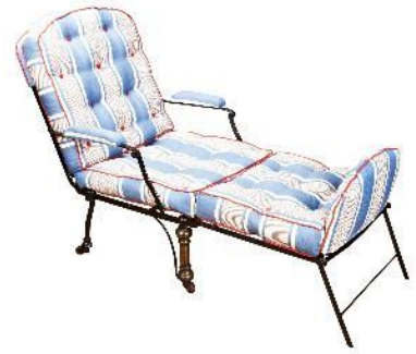
Late 19th century folding iron chair bedstead, £1,650 from Christopher Clarke Antiques