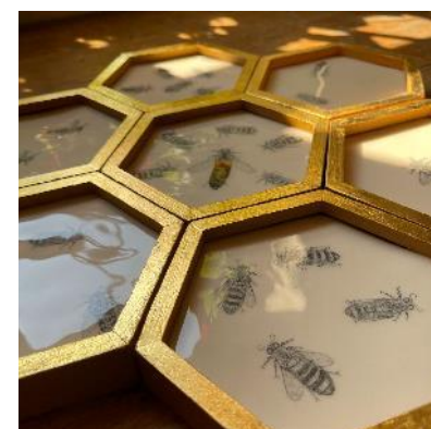
'Honeycomb' by Tom Rooth, comprising a number of individual underglazed pencil on glazed earthenware, surrounded by wooden frames covered in 23.5 carat gold leaf, signed, numbered, inscribed and dated (on the reverse). Each individual honeycomb piece is £195; Queen bees are fired with gold lustre and are priced at £225, all from Tom Rooth