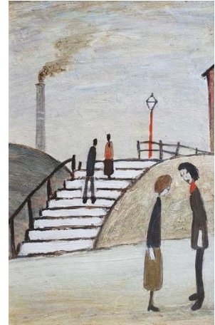
Arthur Delaney, 'The Steps', oil on board, 9¼ x 7¼ inches, price £9,850 from Haynes Fine Art - London & Cotswolds

"The fair maintains a respected reputation for the outstanding quality of items on display. The dealers take enormous trouble to showcase their wares in the finest light. Furniture dealers sometimes present room-sets in order to give visitors ideas and inspiration for their homes, often using a combination of antique and contemporary pieces," says Fair Director Ingrid Nilson.