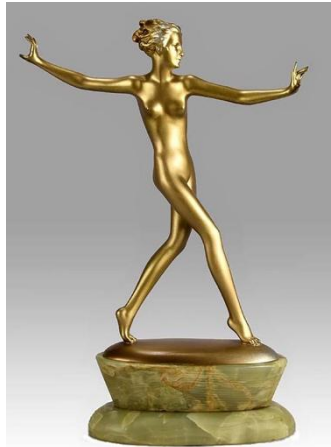
An Art Deco cold painted bronze figure of a dancer, signed Lorenzi, price £4,450 from Hickmet Fine Arts