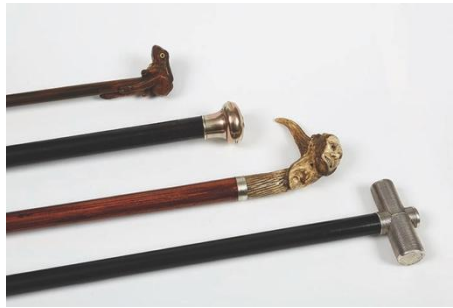
Four Victorian walking sticks, price £850 - £1,100 from Stephen Kalms Antiques