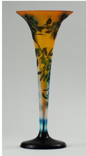
An Art Nouveau Emile Gallé tall, elegant, trumpet shaped vase, French, c 1900, price £4,250 from Solo Antiques