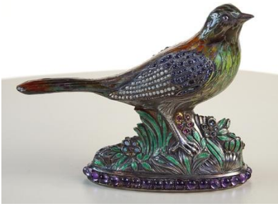
An enameled bird set with pearls, rubies and sapphires with cabouchon amethysts around the base, price £2,500 from The Antique Enamel Company