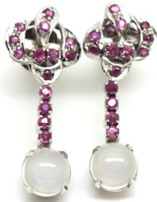
Cat eye ruby and diamond drop earrings, price £1,450 from Greenstein Antiques