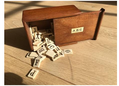
A 19th century Victorian spelling box with bone letters, price £295 from Opus Antiques.