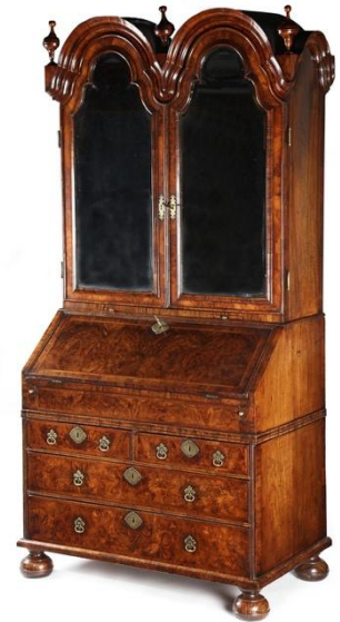
A Queen Anne burr walnut and feather banded double dome bureau bookcase, English, c 1705, price £39,000 from Millington Adams