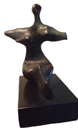
Small maquette by Henry Moore, bronze, edition of 9, £61,360 from Richwood Fine Art