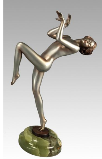
One of a series of Art Deco cold painted bronze dancing girls by Josef Lorenzl, £1,850 - £4,500 each from Hickmet Fine Arts