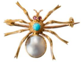
A 15ct gold, turquoise, pearl and ruby eyed spider brooch, c1900, £885 from T Robert