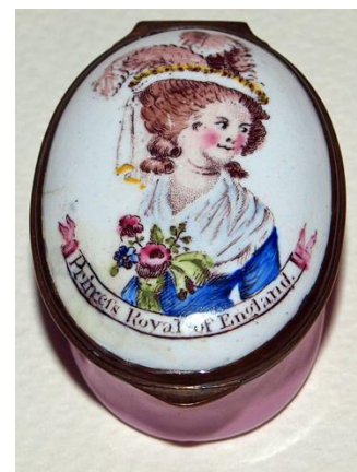
English enamel patch box depicting Princess Charlotte, c1816-17, £895 from JA Yarwood Antiques

P.O. Box 119 Cranbrook Kent TN18 5WB Telephone 01797 252030 E-mail info@adfl.co.uk Web www.adfl.co.uk Reg. no. 04293279 (England & Wales)