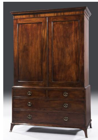
18th century George III Hepplewhite period mahogany linen press, stamped Gillows of Lancaster, c1785, £7,250 from Freshfords Fine Antiques