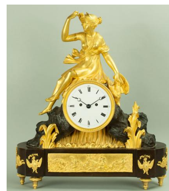
English double fusée bronze and ormolu mounted mantel clock by F Baetens, c1825, £5,950 from FJ & RD Story Antique Clocks

Antiques fair ticket holders gain complimentary access to Harewood's grounds, gardens and Below Stairs. For £5 each, (saving £11.50 on an Adult Freedom ticket) fair visitors can upgrade to see the State Rooms and current exhibitions marking the 300th anniversary of Lancelot 'Capability' Brown's birth. Harewood House's exhibitions and activities include The Art of Landscape which presents a full and fresh assessment of the cultural influence of the 'Capability' Brown design at Harewood. Great Capabilities; a celebration of "Capability" Brown at Harewood takes place from 4 to 12 June, celebrating the achievements of the great landscape designer at Harewood in a series of walks, talks and exhibitions. Visit www.harewood.org for more information.