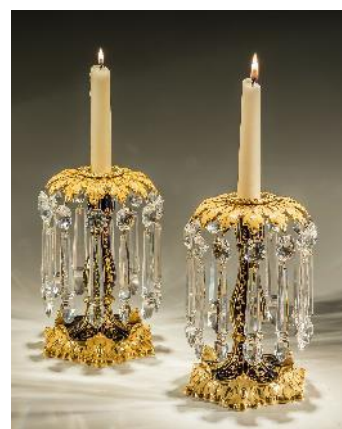
Pair of Rockingham porcelain candlesticks, English, c.1830, £4,850 from Fileman Antiques