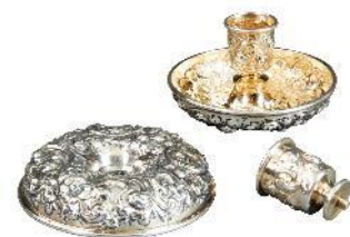
Pair of American sterling silver Brighton buns travelling candlesticks, c.1870, in the region of £1,100 from Christopher Clarke Antiques