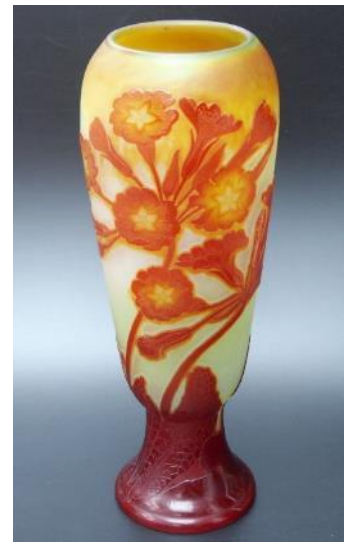
Emile Gallé deeply cut cameo Primula vase, c.1908, £2,950 from M&D Moir

Transport: By Road: A272 Tillington Road (antiques fair entrance at New Lodges).