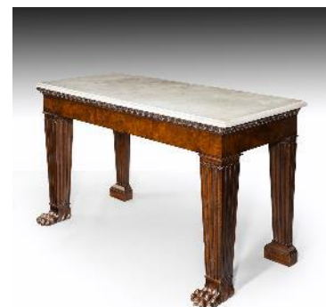
George III console table with the original marble top, £10,500 from William Cook