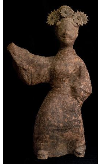
Sichuan Dancer 漢代川蜀舞女俑, Han Dynasty (206-220 BCE), £12,500 from W. Shanshan 珊珊軒