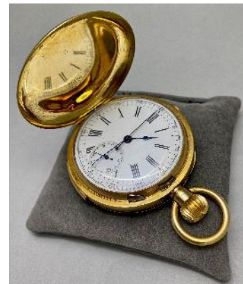
18ct gold Swiss quarter repeating pocket watch, c.1910, £3,250 from Shapiro & Co.

Amongst the paintings for sale on Lucy B. Campbell's stand is work by Sussex artist Anna Pugh (b. 1938) including Mists of Time , acrylic on board. The Swan Gallery brings paintings by Marcel Dyf and William Lee-Hankey's The Goose Girl , oil on canvas, £22,000 and maps including 'Hampshire, by C Saxton Corrected and many Additions by P Lea' (amendment using the original Saxton plate of 1579), 1720, £2,400. Blackbrook Gallery returns with its naïve animal