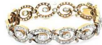
Art Deco diamond bracelet £12,950 from Greenstein Antiques