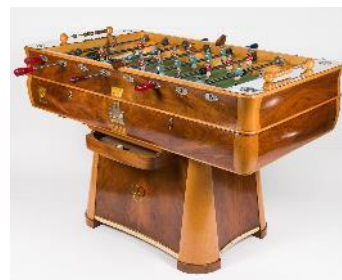
A 1950's Olympic competition Baby-foot La National table by Tousjeux et Nouveautés of Geneva, £11,500 from Hatchwell Antiques

P.O. Box 119 Cranbrook Kent TN18 5WB Telephone 01797 252030 E-mail info@adfl.co.uk Web www.adfl.co.uk Reg. no. 04293279 (England & Wales)