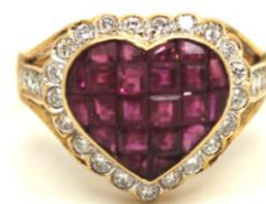
Fancy yellow diamond heart ring, £8,950, ruby & diamond heart ring, £5,950 from Greenstein Antiques