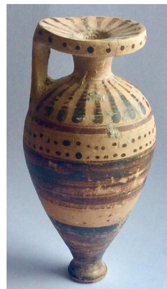
An Etruscan-Corinthian perfumed scent bottle, 5th century BC, £350 from Odyssey Antiquities & Coins

P.O. Box 119 Cranbrook Kent TN18 5WB Telephone 01797 252030 E-mail info@adfl.co.uk Web www.adfl.co.uk Reg. no. 04293279 (England & Wales)