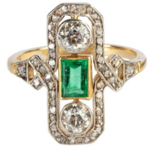
18ct gold, platinum Colombian emerald and diamond ring, c. 1910, £3,350 from T Robert