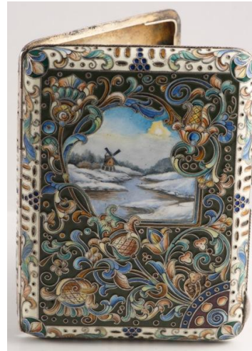
A Russian shaded enamel case from the 6th Artel of Moscow, c.1900, £4,500 from Shapiro & Co