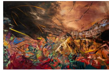
'Emergence' by Emily Lamb, oil on canvas, £13,500 from Rountree Tryon Galleries