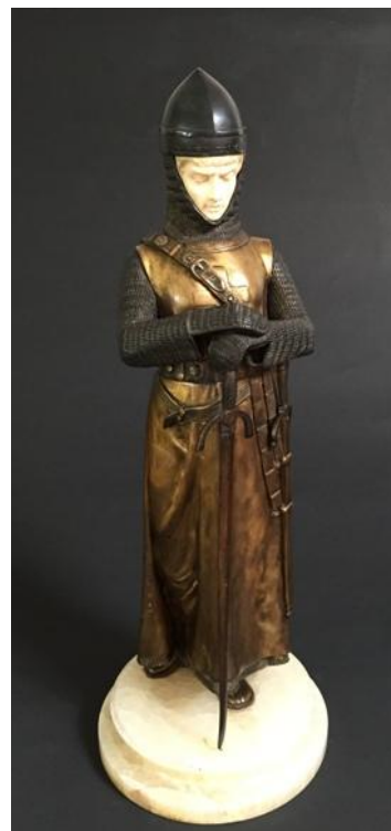
'Chevalier' by Dominique Alonzo bronze, c.1912, £4,595 from Garret & Hurst Sculpture