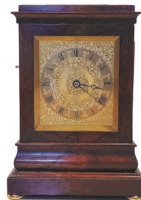
FRODSHAM CLOCKS Rosewood cased mantel clock by Lister of Newcastle, £18,500