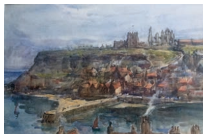
GRAHAM REED FINE ART