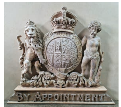
MELODY ANTIQUES Royal Warrant crest shop sign for Edward VII (1901-1910), carved pine, H 3ft W 4 ft, £2,750