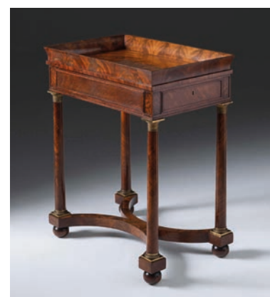
McBAIN & BYRNE A Regency period ormolu mounted mahogany vide poche centre table attributed to S Jamar in the French Empire style, English, c1820, H 73.5 cm, W 60.5 cm, D 41 cm, £12,500