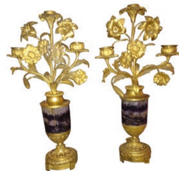
THE ANTIQUES BAZAAR Pair of ormolu and Blue John candelabra c1800-1820, £17,650