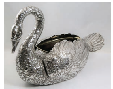
HIGHLAND ANTIQUES A rare German silver Edwardian swan, Hanau, c1900, £3,450