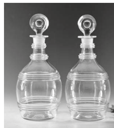
McBAIN & BYRNE

Victorian 15 ct gold cabochon opal necklace, c1890