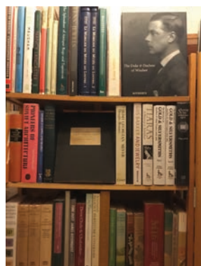
NICHOLAS DALY BOOKS Selection of first edition book titles