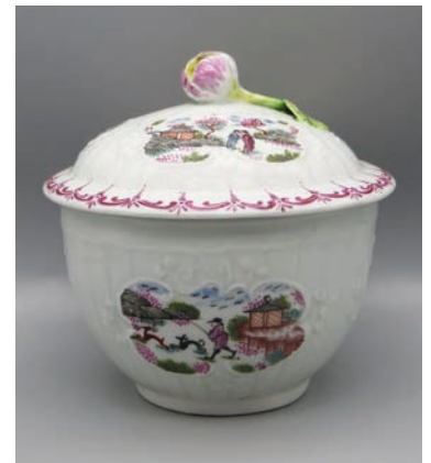
DAVID SCRIVEN ANTIQUES Early Worcester porcelain sucrier painted with elements of the Stag Hunt pattern, c1755-58, £1,450