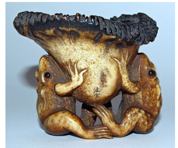
J A YARWOOD ANTIQUES Rare Japanese large stag antler group of two toads sitting on a lily pad. Asakusa School, c. 1870, £3,385