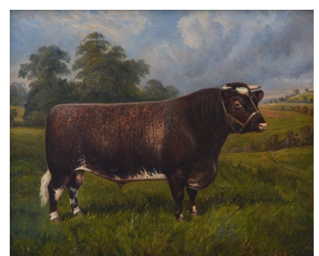
BLACKBROOK GALLERY W A Clark, Castleton Style, signed and dated W A Clark 1925 Oil on canvas, 24 x 20 inches, £3,750