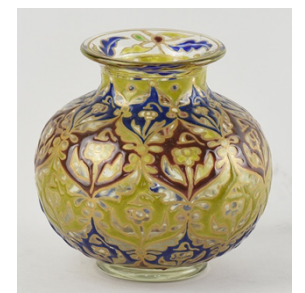
SOLO ANTIQUES Enamelled glass vase in the Persian style by Emile Galle French c 1885 signed Emile Galle a Nancy, 15.5 x 15 cm, £2,450