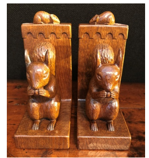
PTARMIGAN ANTIQUES Pair of 1940s-1950s Mouseman squirrel book-ends