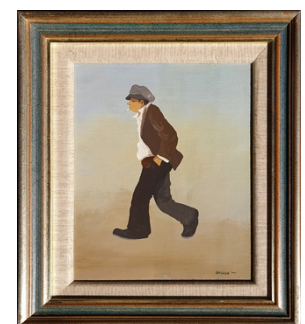
HAYNES FINE ART – LONDON & COTSWOLDS BRIAN 'Braq' SHIELDS Off to the Pub Oil on canvas, 10.25 x 8 inches, in region of £7,000-8,000