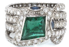
GREENSTEIN ANTIQUES Emerald, sapphire & diamond snake ring set in 18k white gold