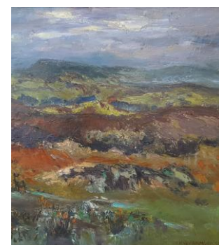
'Near Loch Thom Greenock' (detail) by Mary Armour RSA RSW, oil on canvas, £11,850 from Granta Fine Art

P.O. Box 119 Cranbrook Kent TN18 5WB Telephone 01797 252030 E-mail info@adfl.co.uk Web www.adfl.co.uk Reg. no. 04293279 (England & Wales)