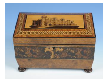
Tunbridge ware tea caddy featuring Eridge Castle, c.1850, £1,295 from Amherst Antiques