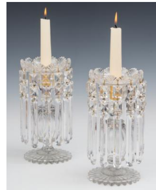
A pair of lusters, English, c.1820, £1,650 the pair from Fileman Antiques