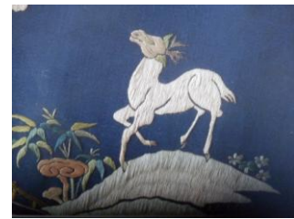
Chinese embroidered silk panel, c.1870, £395 from Catherine Hunt Oriental Antiques