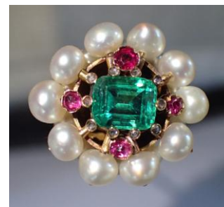
Siberian emerald, natural pearl, ruby and diamond hat pin with diamond set claws, c.1830, £2,850 from T Robert