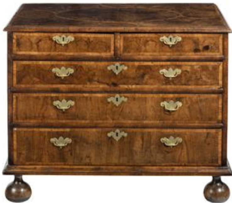
George I burr walnut chest of drawers, 34" wide, £6,900 from Melody Antiques

The tenth Esher Hall Antiques & Fine Art Fair opens from Friday 6 to Sunday 8 October 2017 in the Esher Hall at Sandown Park Racecourse, Portsmouth Road, Esher, Surrey KT10 9AJ. This prestigious annual event is frequented by interior designers, international collectors and people seeking something unique.