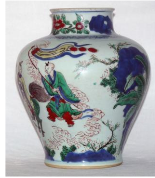
17th century transitional wucaijar, 25cm, £9,000 from Catherine Hunt Oriental Antiques