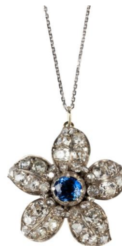
An 18ct. gold Ceylon sapphire and diamond flower pendant/brooch, c.1850, £7,400 from T Robert