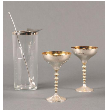
Glass and silver mixer, Denmark, 1949, £1,100 and a pair of silver goblets by Stuart Devlin, 1976, £1,775 the pair from Stephen Kalms Antiques

Visitors can enjoy a meal in Browns, The Mere's contemporary restaurant with 2AA rosettes or for a simpler option, there are light refreshments within the fair and free parking making it a one-stop shop and an entertaining day out. Bridgefields is on hand to pack and deliver items locally or anywhere in the world.