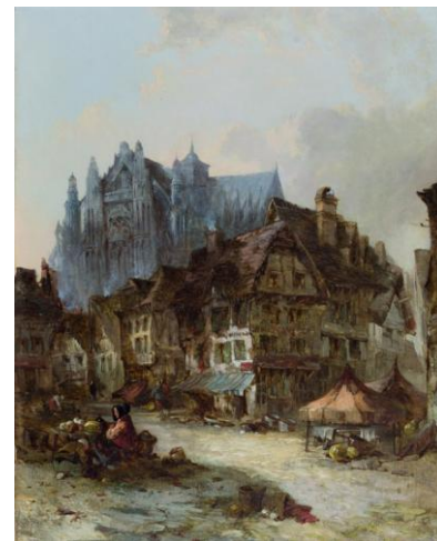
'A Dutch Canal' by Alfred Montague, oil on canvas, signed, 19th century, £3,850 from Cambridge Fine Art