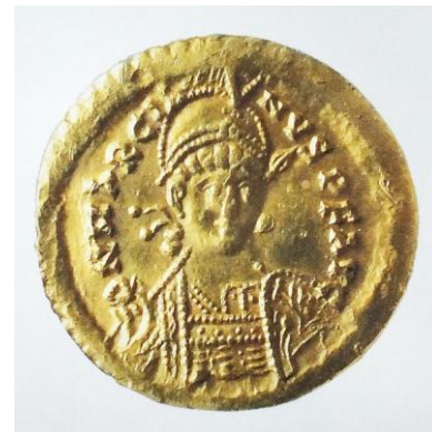
Byzantine gold solidus of the Emperor Marcian, AD 450-457, £725 from Odyssey Antiquities & Coins