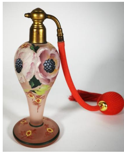
Nancy handpainted Art Nouveau perfume atomiser, France, circa 1900, £195 from Antiques by Design