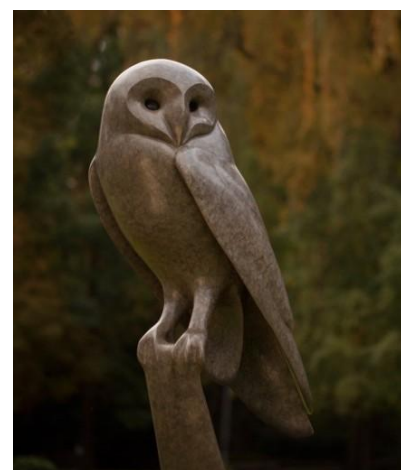
Bronze 'Barn Owl' by Carl Longworth, 198cm high, edition of 9, £30,000 from The Soden Collection

P.O. Box 119 Cranbrook Kent TN18 5WB Telephone 01797 252030 E-mail info@adfl.co.uk Web www.adfl.co.uk Reg. no. 04293279 (England & Wales)