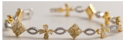
18ct gold fancy yellow & brilliant cut diamond bracelet, c.1970, £17,500 from Shapiro & Co