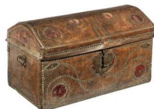
Oak carved front coffer, c1720, £895 from Melody Antiques