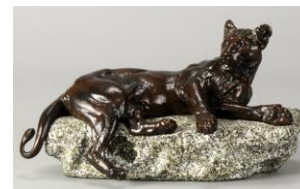
Reclining bronze lioness resting on a shaped granite base, signed Valton, c.1900, £2,650 from Hickmet Fine Arts

*Tickets include access to Harewood's grounds and Below Stairs. For an extra £5, antiques fair ticket holders can gain access to Harewood House's State Rooms, including the current exhibitions.