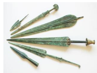
A selection of ancient British, Greek and Middle Eastern blades and arrowheads, dating from 2nd millennium BC, copper alloy (bronze), £55 to £650 from Odyssey

The Antiques Dealers Fair Limited has an ongoing relationship with the Queen Elizabeth Scholarship Trust (QUEST) , the charitable arm of the Royal Warrant Holders