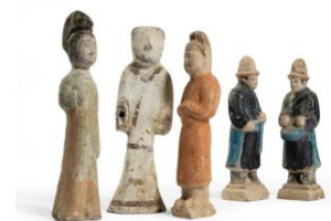
A selection of Chinese figures, 206BC - 1644 AD, £225 to £395 from Odyssey