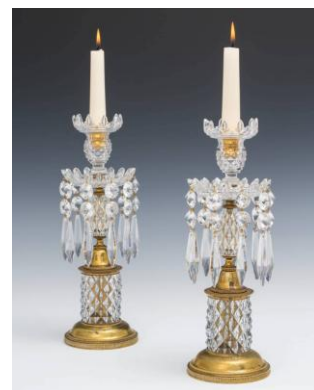
A pair of Regency cut glass drum base candlesticks, English, c1800, £5,000 from Fileman Antiques