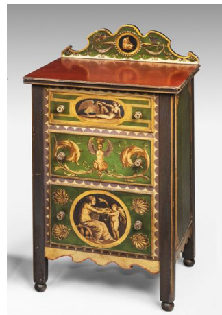
One of a pair of decorated bedside chests, c.1920, £2,250 the pair from William Cook Antiques

P.O. Box 119 Cranbrook Kent TN18 5WB Telephone 01797 252030 E-mail info@adfl.co.uk Web www.adfl.co.uk Reg. no. 04293279 (England & Wales)