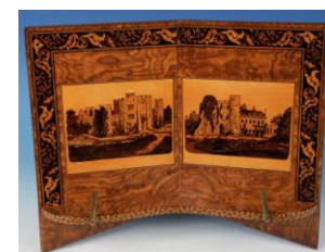
Tunbridge Ware bookstand and views of Tonbridge & Hever castles, c.1870, £945 from Amherst Antiques