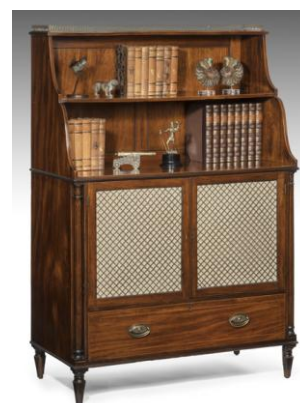
A Regency period mahogany bookcase, c.1800, £3,300 from William Cook