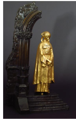
'Reflections among the Ruins' by Dominique Alonzo, French, gilded bronze, c1920, £4,450 from Garret & Hurst Sculpture