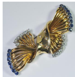
18ct gold, sapphire & diamond brooch by Gubelin, Swiss, 1950s, £7,500 from Plaza