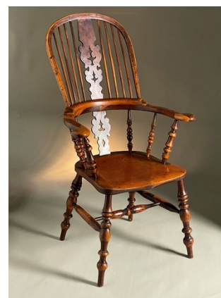
PETER BUNTING ANTIQUES A fine Windsor chair in figured yew and burr wood, c.1860, £2,200