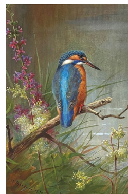
CARNES FINE ART Archibald Thorburn (1860-1935) Kingfisher, watercolour, 18 x 26 cm POA