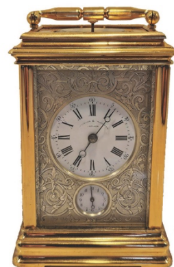
FRODSHAM CLOCKS A late 19 th century Parkinson & Frodsham carriage clock, the enamel dial signed by the renowned Parkinson & Frodsham firm c.1880, £2,750