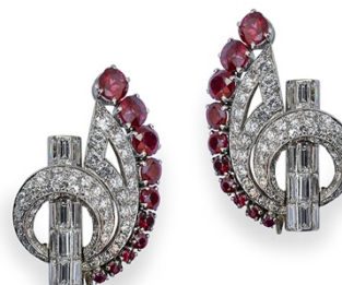
HOWARDS JEWELLERS Ruby and diamond earrings, c.1930