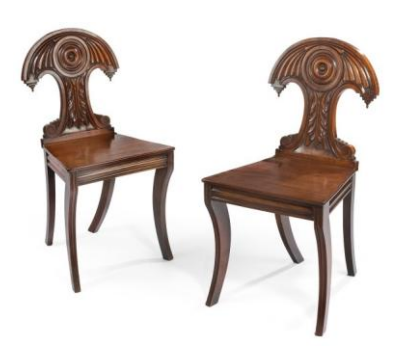
Pair of Regency mahogany hall chairs, c1820, £4,500 from S&S Timms Antiques