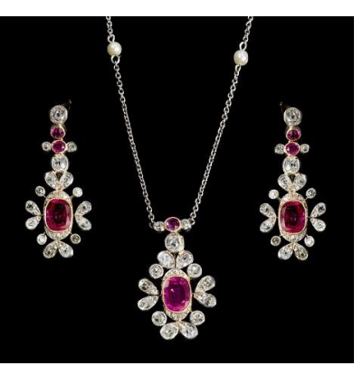
An 18ct gold and platinum Burmese ruby, diamond and natural pearl necklace and earrings, c1905, £8,800 from T Robert