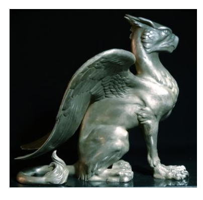
Paul Kidby's latest limited edition bronze griffin 'Nemesis II Sejant' with a silver patination, edition of 12, £7,450 from Art of the Imagination