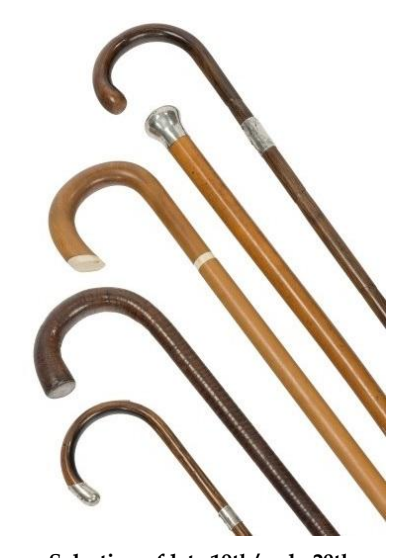
Selection of late 19th/early 20th century walking sticks, late 19th/early 20th century including a bull's pizzle, £100-200 from Mark J West