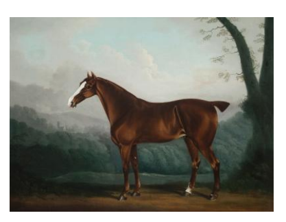
'Portrait of a bay hunter in a wooded landscape, a church in the distance', by Daniel Clowes, 1819, £8,500 from Strachan Fine Art.

ANTIQUES WEEKEND The Mere 7 – 9 February 2014