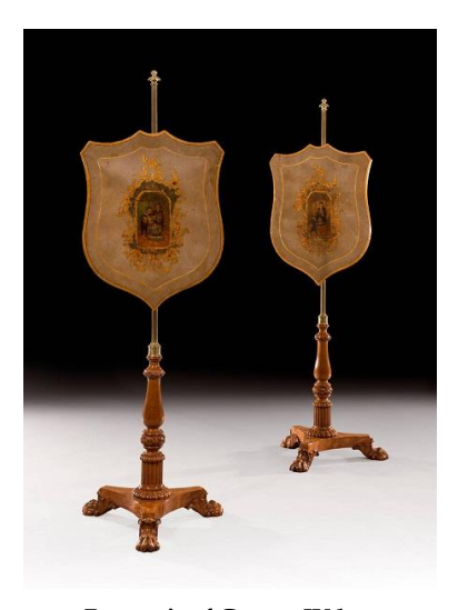
Rare pair of George IV late Regency carved satinwood pole screens, attributable to Gillows of London and Lancaster, £7,500 from Freshford Fine Antiques

P.O. Box 119 Cranbrook Kent TN18 5WB Tel/Fax: 01797 252030 E-mail: info@adfl.co.uk Web: www.adfl.co.uk Reg. no. 04293279