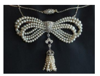
Belle Epoque platinum pearl and diamond pendant brooch by Harvey & Gore, c1910, £6,850 from T Robert