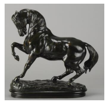
'Cheval Turc' bronze by Antoine-Louis Barye, c1850, £48,500 from Hickmet Fine Arts