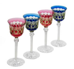
Four triple layer hock glasses (red and blue over uranium and crystal), English, c1920, £480 per pair from Mark J West