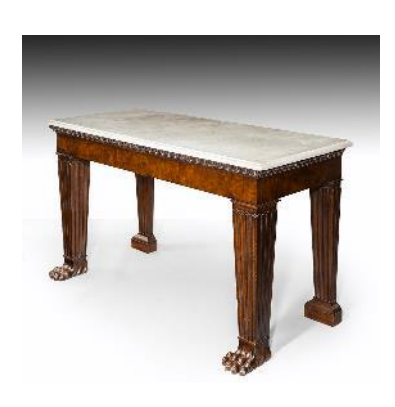
George III console table with the original marble top, £10,500 from William Cook