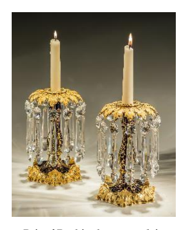
Pair of Rockingham porcelain candlesticks, English, c.1830, £4,850 from Fileman Antiques