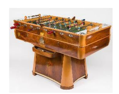
A 1950's Olympic competition Baby-foot La National table by Tousjeux et Nouveautés of Geneva, £11,500 from Hatchwell Antiques

P.O. Box 119 Cranbrook Kent TN18 5WB Telephone 01797 252030 E-mail info@adfl.co.uk Web www.adfl.co.uk Reg. no. 04293279 (England & Wales)