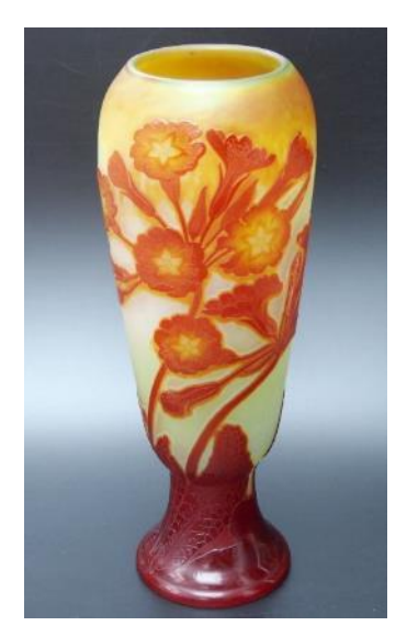
Emile Gallé deeply cut cameo Primula vase, c.1908, £2,950 from M&D Moir

Transport: By Road: A272 Tillington Road (antiques fair entrance at New Lodges).