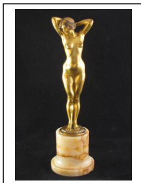
Art Deco gilt bronze nude figure on a marble base by Joseph Descomps, French, c.1925, POA from Solo Antiques

Opening times: Thursday 14.00-20.00; Friday & Saturday 11.00-18.00; Sunday 11.00-17.00