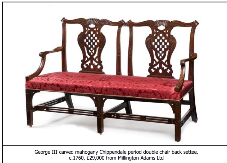
George III carved mahogany Chippendale period double chair back settee, c.1760, £29,000 from Millington Adams Ltd