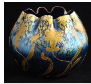
Loetz 'Papillon' glass vase, Bohemian, approx 12 cm high and 15cm wide, c. 1895, POA from Solo Antiques

£6,500 from Jack Shaw & Co of Ilkley. Other silver dealers include J H Bourdon-Smith Ltd and Stephen Kalms Antiques .