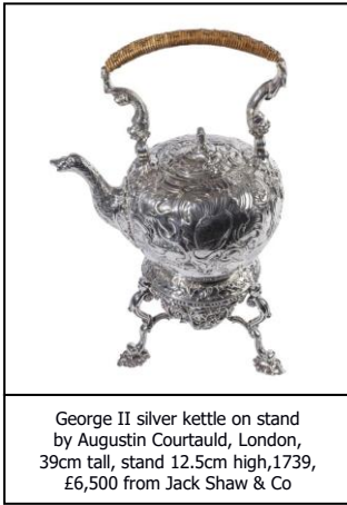
George II silver kettle on stand by Augustin Courtauld, London, 39cm tall, stand 12.5cm high, 1739, £6,500 from Jack Shaw & Co