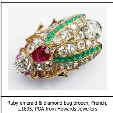
Ruby emerald & diamond bug brooch, French, c.1895, POA from Howards Jewellers