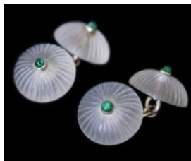
Pair of Art Deco carved rock crystal, cabochon emerald and platinum cufflinks, English, c.1925, POA from Licht & Morrison