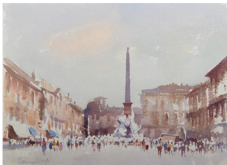
'The Fountain of the Four Rivers, Piazza Navona, Rome' signed watercolour by Edward Seago RBA RWS (1910-1974), 11" x 15" inches, £15,000-20,000 from Haynes Fine Art