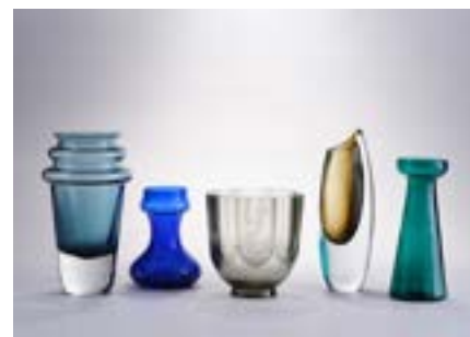
ALDERNEY & WRIGHT Collection of 19th and 20th English and Scandinavian glass