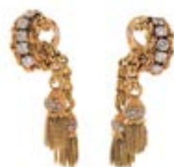
HOWARDS JEWELLERS Pair of diamond earrings by Van Cleef & Arpels, c.1965