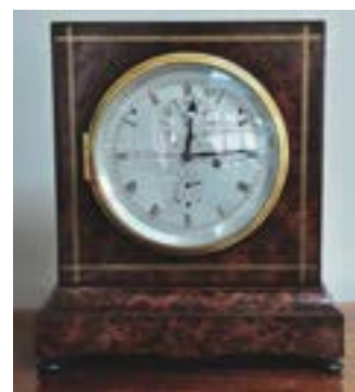
FRODSHAM CLOCKS A very rare 8-day mantel chronometer by Mercer, numbered 677 dating from 1930, 29cm x 26cm wide, price £16,500