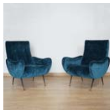
JEROEN MARKIES ART DECO Pair of mid century lounge chairs, price £2,250