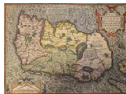
J DICKINSON MAPS & PRINTS One of the earliest maps of the whole country of Ireland by the famous mapmaker Abraham Ortelius from a 1590 edition, price £1,675