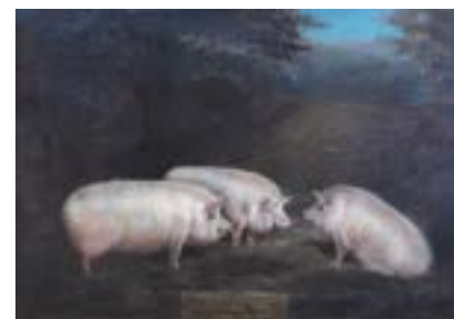
BLACKBROOK GALLERY 'Three Prize Pigs' , 22 x 29 inches, oil on canvas, price £11,500