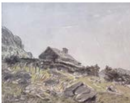
MARK ROWLES FINE ART Sir Kyffin Williams, Anglesey cottage , watercolour, 15 x 19 inches, price £9,500